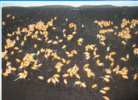
Day 4 - With No Filtration