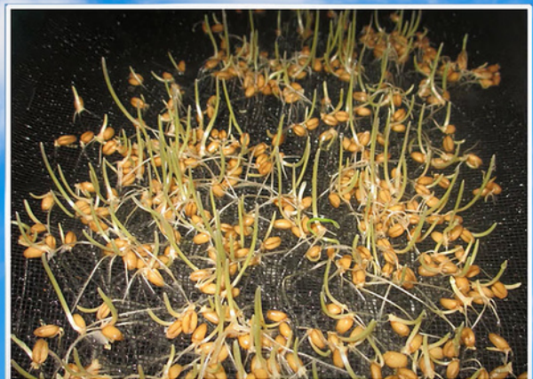
Day 4 - With Filtration & GRANDER